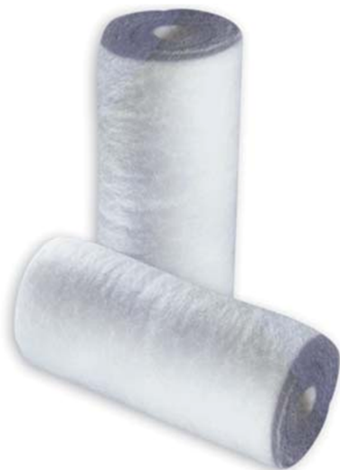
Figure 1: Aquatrex Filters