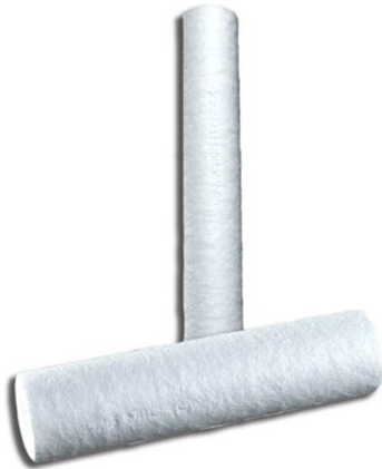
Figure 1: Hytrex Depth Cartridge Filters